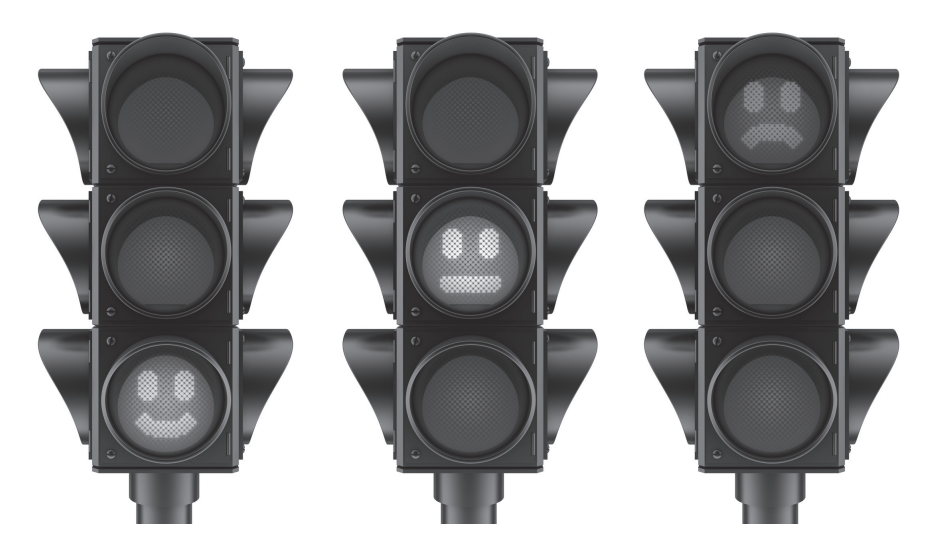
Figure 12.2 Use of emojis in the environment

In recent years, there has been a novel emergence of the use of the emoji as a childfriendly equivalent to the widely used Likert-scale form of psychometric measurement. In this sense, communication is enhanced as a result of considering the simplicity with which it takes place (Hickson, 2013). Depending on the child's age, a standard Likert-scale version of a questionnaire may appear to be a daunting and confusing document; however, the incorporation of emojis in the form of 'smiley faces' can transform the same document. Indeed, the same principle applies to adults and is not restricted to psychometric measures, as illustrated when we were travelling towards a small village in Worcestershire recently. The mandatory 30mph speed limit sign was prominently displayed and of course we began to slow down in order to adhere to it. A car that was a little distance ahead of us did not appear to slow down sufficiently and, just after this sign, another sign suddenly illuminated with a red