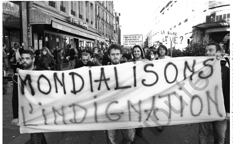
Crowd of young people in Europe carrying anti-globalization banner bearing the words “global indignation.”

The United States also has a history of avowed isolationism (with the notable exception of its intervention in Latin America). It can be traced from the farewell address of President