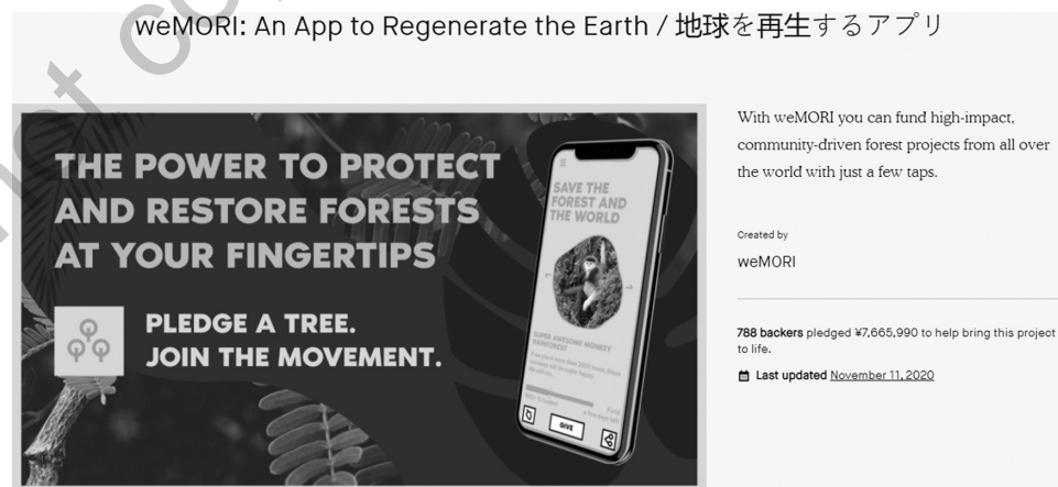
FIGURE 1.2 ● Kickstarter Project: weMori App to Regenerate the Earth