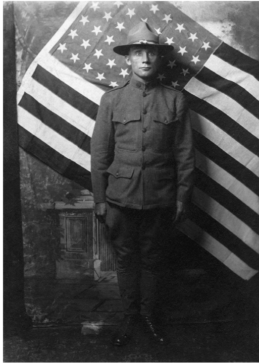
Photo 5.1 Patriotism, World War I