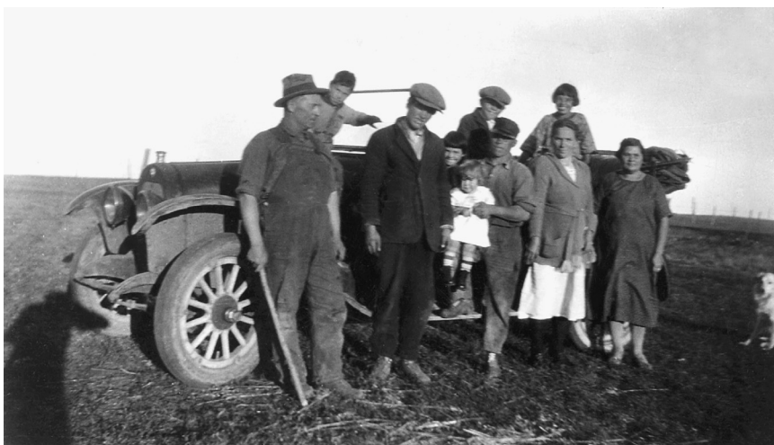
Photo 5.3 Okies on The Way to California