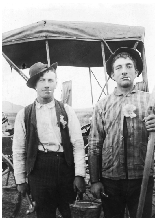
Photo 5.4 Casual Workers on a Break