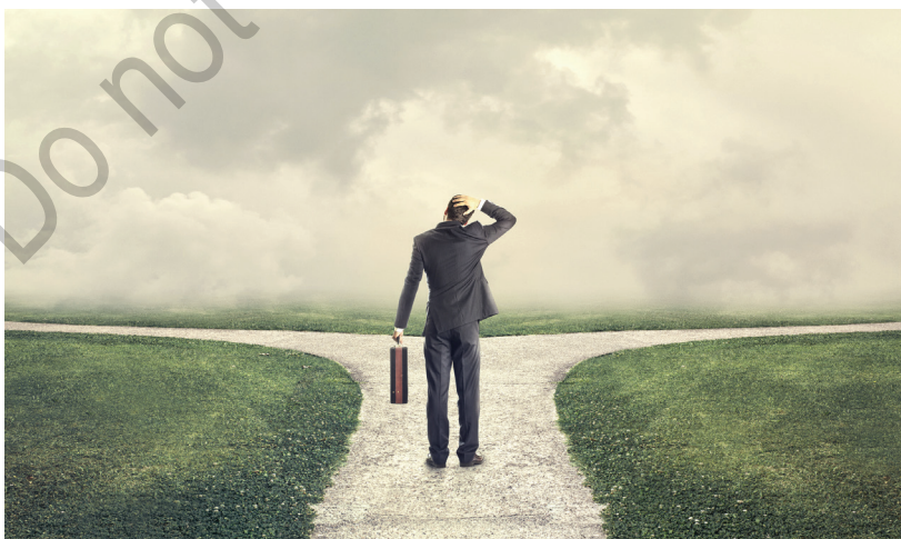
FIGURE 2.2 Considering the Paths

How do the statements of shared truths create a collective culture?