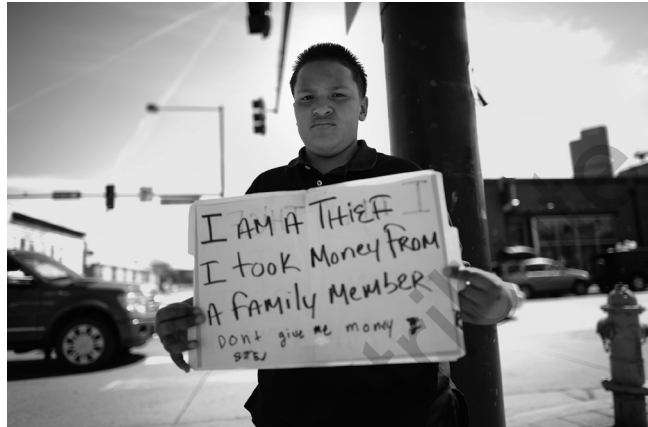
► Photo 1.5 Offenders being forced to hold signs as part of their punishment is becoming a more popular informal sanction that shames individuals in their communities.

Such issues will be raised again later when we discuss the sociological theories of Émile Durkheim. Nevertheless, it is interesting to note that some judges and communities have gone back to public-shaming punishments, such as making people carry signs of their offenses or putting the names of offenders in local newspapers. But the conclusion is that rural communities tend to have far higher informal controls, which keep their crime rates low. On the other hand, urban (especially inner-city) areas tend to be