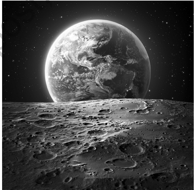
► Photo 1.1 Earth as seen from the surface of the moon. Theories of Earth as the center of the universe were dominant for many centuries, and scientists who proposed that Earth was not the center of the universe were often persecuted. Over time, the theory was proved false.

The same type of argument could be made about Earth being flat; at one time, observations and all existing models seemed to claim it as proven and true. Some disagreed and decided to test their own predictions, which is how America was discovered by European explorers.