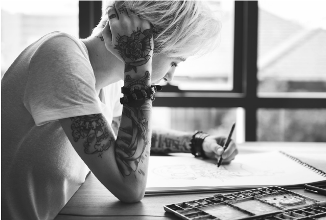
► Photo 1.3 Early theories identified criminals by whether they had tattoos; at that time, this might have been true. In contemporary times, many individuals have tattoos, so this would not apply.

leads to greater opportunities and tendencies to engage in criminal activity. This brings us to the final criterion for determining causality.