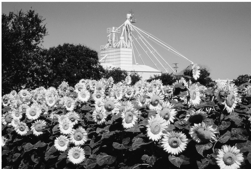
FIGURE 2 Sunflowers and silo, Garden City, Kansas, USA