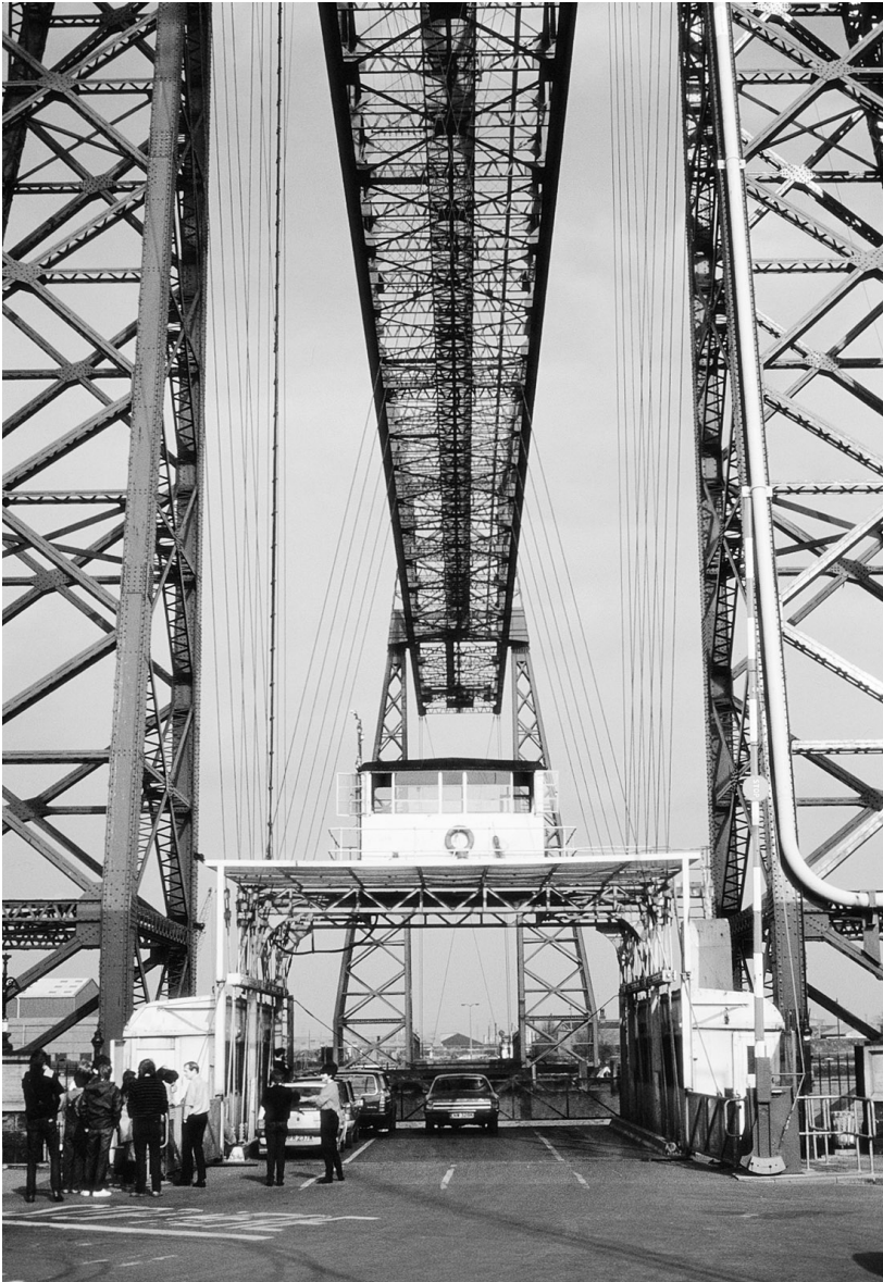
FIGURE I Transporter Bridge, Middlesbrough, England